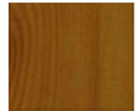
Knotty Pine 2103/01 DS 403 Smooth DS 733 Texture