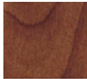
Cherry Flame 1401/01 DS 402 Smooth DS 716 Texture