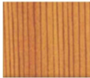
Douglas Fir 1502/02 DS 402 Smooth DS 716 Texture