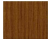
Narrow Oak 2502/01 DS 403 Smooth DS 733 Texture