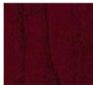
Mahogany 1802/02 DS 406 Smooth DS 706 Texture

*All finishes available with antimicrobial additive