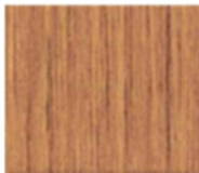
Narrow Oak 2502/01 DS 402 Smooth DS 716 Texture