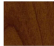
Cherry Flame 1401/01 DS 403 Smooth DS 733 Texture