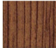
Straight Cherry 1402/02 DS 403 Smooth DS 733 Texture