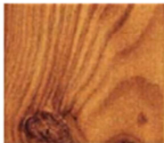
Knotty Pine 2103/01 DS 402 Smooth DS 716 Texture