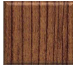
Straight Cherry 1402/02 DS733