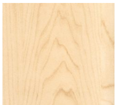
Light Maple 1201/03 DS708