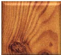
Knotty Pine 2103/01 DS716