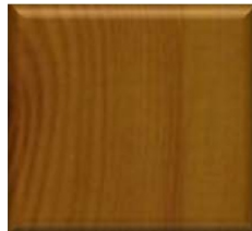
Knotty Pine 2103/01 DS733