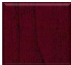
Mahogany 1802/02 DS706

*Color swatches are shown for example only. Due to color variation in the finishing process, the swatches are not intended as exact matches. *Custom finishes available upon request, limitations may apply.