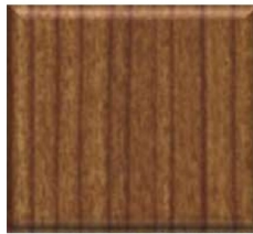
Straight Cherry 1402/02 DS716