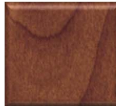
Cherry Flame 1401/01 DS716